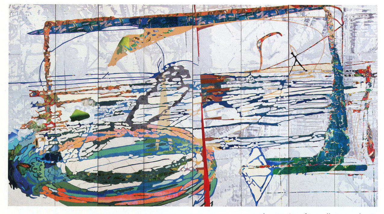
From top: Rollover , 1989, tin collage on plywood with steel brads, 132 x 240 in.; Within , tin collage on plywood with steel brads, 2006, 36 x 48 in.